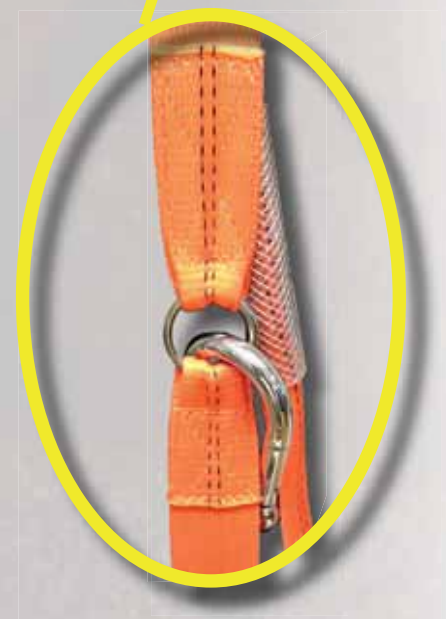
Detailed picture of the loaded part without any visible damage.

Kristianstad 25/8-2008 At the test Dan Runerfeldt