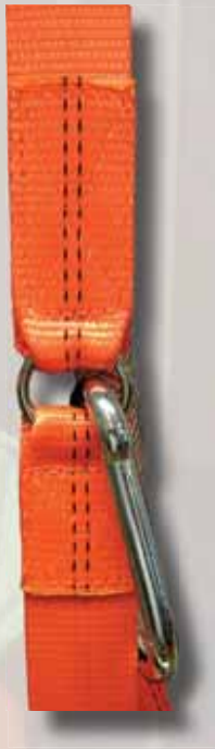
Picture of the strapped part under zero load.

As it is not possible to mount the entire carrying system in the loading equipment there is a part which is assessed to be the weakest is strapped in and subjected for the load test. This part consists of 2 sewn crosses with a steel ring fastened in between.