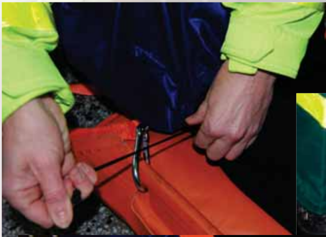
Put the patients feet in the bag and then pull the lace lock above the ankles so that the feet won't slip out, but not that hard that there is a risk for stasis.