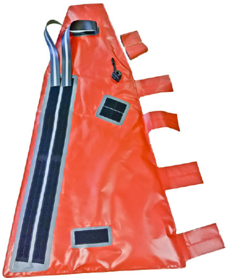
Full Leg Splint