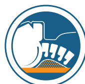
REINFORCED WOOD INNER SYSTEM