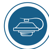
MULTI FIT VALVE WITH LID