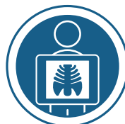
X-RAY MRI AND CT TRANSLUCENT