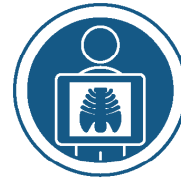
X-RAY MRI AND CT TRANSLUCENT