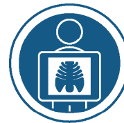
X-RAY MRI AND CT TRANSLUCENT